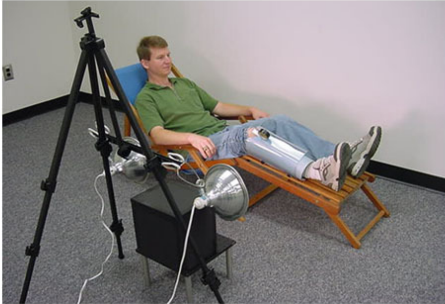
Figure 1 Test setup includes a lawn chair, a custom erythema inducer, a CCD camera and filter-wheel and incandescent lighting.

Algorithm 1: (2 \cdot 550nm - 650nm) \cdot 950nm